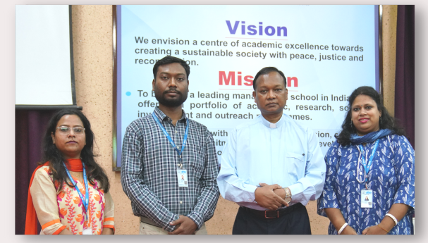
XISS Bulletin Team