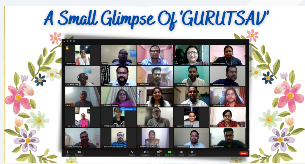
GURUTSAV celebration by AAWAZ