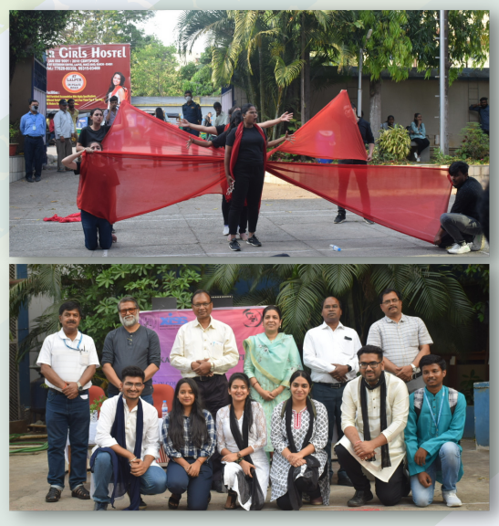
Panelists and participating students during the ICC Nukkad Natak Competition

Internal Complaint Committee of XISS, Ranchi, in collaboration with Aawaz Club the dramatic society of XISS, organized a Nukkad Natak competition for creating awareness regarding gender discrimination and harassment as a part of its yearly training and awareness program in XISS Courtyard. Director, XISS in his address to the gathering said that man and women are complementary to each other and one cannot function without the other. Thus, it is important to sensitize people about Gender Equality and so the theme of this event holds great importance. He also emphasised on the "Importance of Gender equality in every sphere of life and breaking the stereotypes persisting in the society". The 1st prize was won by Team Rudraksh (theme - cleanliness of mind and state of women in the society) of Financial Management Programme and received a cash prize of Rs 7000; 2nd prize was won by team Aayna (theme - Sexual harassment at workplace) of Rural Management Programme who won Rs 4000. Team Nayan (theme - politics and workplace harassment) of Marketing Management Programme and Team Forced (theme - Gender Stereotypes) of Human Resource Management also presented their acts and all the participants received certificates of participation.