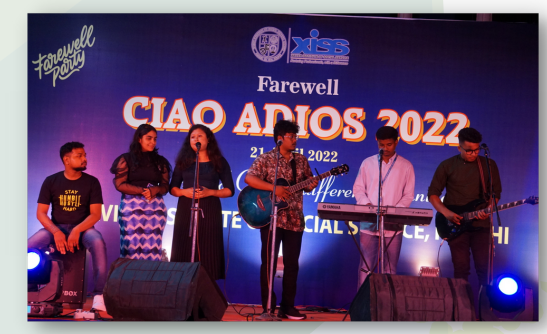
Students performing during CIAO ADIOS '22, a farewell to batch 2020-22.

To read more on the celebration, click on the link: https://www.xiss.ac.in/readmore/xiss-bid-farewell-to-the-batch-of-2020-22