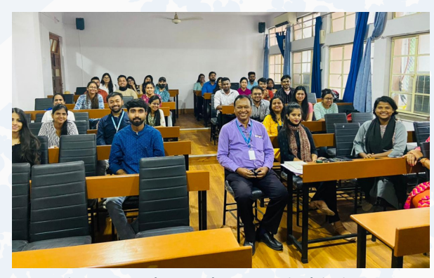
On 2 September 2021, Director interacted with the representatives of Institutional clubs of XISS