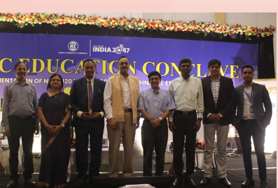
The 4th ICC Education Conclave