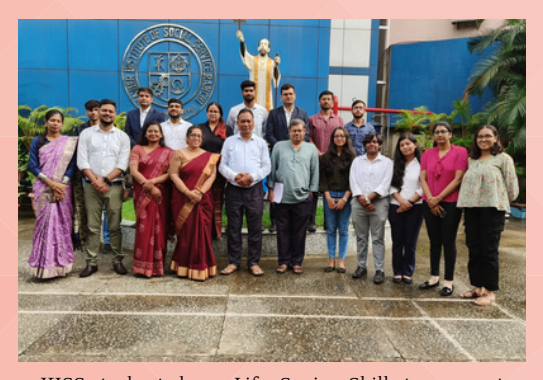
XISS students learn Life-Saving Skills to prevent

Urban Field Exposure (UFE) was also completed by students of the Rural Management Programme. The students were divided into eight groups namely Pragati, Vikas, Asha, Samvedna, Jyoti, Karuna, Prayatna, and Pravah, and were assigned eight slum areas in Ranchi town. The objectives of this exposure were to acquaint the students with real-life slum situations, to understand the urban slumspeople, their lifestyle, their socio-economic conditions and culture and value system. The objectives were met by using skills of observation, interaction, and situational analysis as it helps in bringing about an attitudinal and behavioral change in them.