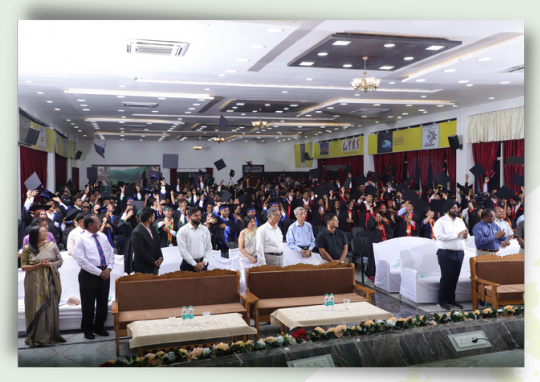
Students celebrating after being declared as graduates