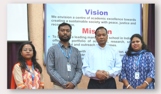
XISS Bulletin Team