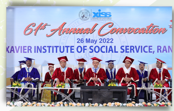
Dignitaries on the occasion of 61st Annual Convocation of XISS, Ranchi